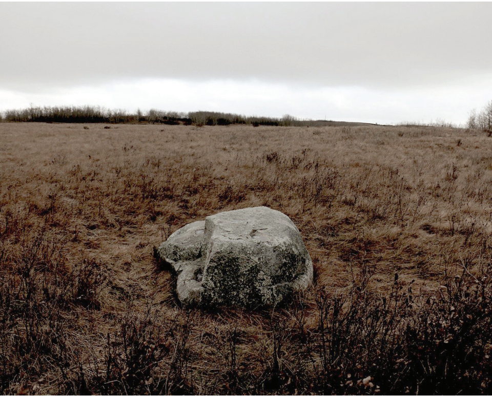
Maria Whiteman, Rubbing Rock , photograph, 2016.

surely be older still. It used to be mobile; now it is not—or at least not in the same way. It has perhaps become a landmark. But it might be important to note that the rock itself had little say in this decision,