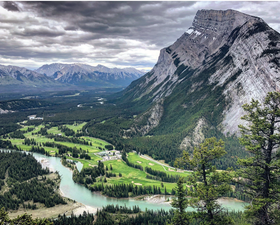
Tunnel Mountain , photograph, 2018.

down to the prairie ground by environmental acts of glacial expansion and melt. Carried on the back of global warming—the last time it happened. This rock is a residue from history warming up.